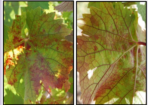
The upper (left) and lower (right) sides of a leaf showing red blotch and red secondary and tertiary veins (right), respectively.

DIAGNOSIS: Grapevine red blotch does not appear to be of recent origin. This disease escaped attention of vineyard owners and managers because of leafroll-like symptoms. This also means that diagnosis based on the leaf symptoms can be challenging. A molecular assay, DNA-based PCR, is currently available and the virus can be detected in the petioles of basal leaves, much before the onset of symptoms, and also in dormant canes. Several private laboratories have started providing diagnosis services to detect the virus by molecular assays.