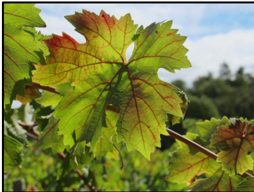
Red blotch and red veins on a leaf of Cabernet Franc grapevine.

DISEASE SYMPTOMS: The symptoms generally start appearing in late August through September as irregular blotches on leaf blades on basal portions of shoots. The secondary and tertiary veins turn partly or fully red. Occasionally, the reddening of leaf blade in the interveinal zones between secondary veins resembles those of leafroll diseases, but the leaf margins do not roll downward. Also, in leaf-roll affected red varieties the secondary and tertiary veins remain green. It is not known if the disease has any effect on fruit yield, and cause vine decline. The most significant impact of the disease appears to be on the Brix units of the berries. Brix of grapes in vines showing red blotch symptoms has been found to be 4 to 5 units lower than those with green canopies and this difference is higher than those normally seen in leafroll-affected grapevines.