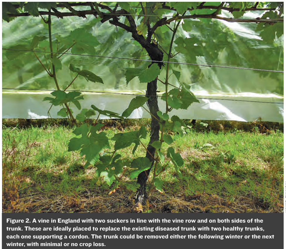
Figure 2. A vine in England with two suckers in line with the vine row and on both sides of the trunk. These are ideally placed to replace the existing diseased trunk with two healthy trunks, each one supporting a cordon. The trunk could be removed either the following winter or the next winter, with minimal or no crop loss.

TTR can be seen as supplementary to these procedures, namely in mature vineyards, and allows for the treatment of early symptom vines and those most at risk because of their location near infected vines.