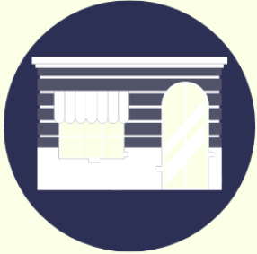
AVA Tasting Room and Production Facility